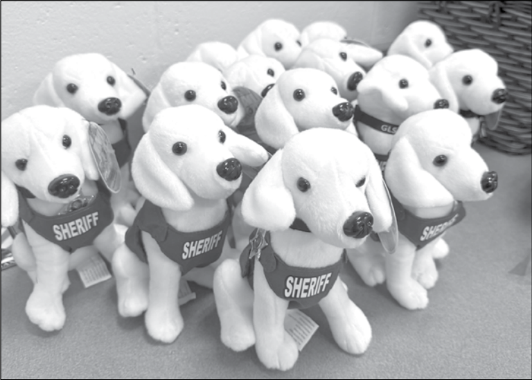
DOZENS OF GIFT BASKETS have been donated in support of the Green Lake County Sheriff’s K-9 program leading up to the 50-bird trapshoot event at the Berlin Conservation Club this Saturday, September 20, starting at 8:30 a.m. FUNDED BY PUBLIC DONATIONS and fundraisers, such as the K-9 plush sales, the Green Lake County Sheriff’s Office is primarily funded by community support.